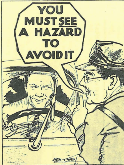
The National Safety Council says: Be sure your windshield wiper blades and arms are in perfect condition. You need one ounce of arm pressure for each inch of rubber blade length to sweep off rain or road spray, instead of sliding over it and causing poor visibility.

Clarke Hatch, popular Chevrolet agent in EC, with one of his salesmen, Troy Wray, were in an accident, while on a fishing trip in his new plane. They were shaken up when a flap froze, causing a crash landing in Mexico. Wray had to be hospitalized. The aircraft was a total wreck, they were very lucky, says the Chevrolet man, who serves Alpine and the back country.