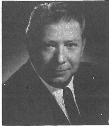
NOTED EMCEE HARRY VON ZELL DID FINE JOB AT UTT CONGRESSIONAL DINNER IN BEAUTIFUL NEW ELKS CLUB, SANTA ANA, WHERE 650 DINED, PAYING HOMAGE TO UTT.

Note- We were doing very well when we enjoyed more safety with a 35-mile center, and 45 adjoining, when the state limit was 60'. Perhaps the new freeway will help some when it gets here in 1966.-CI